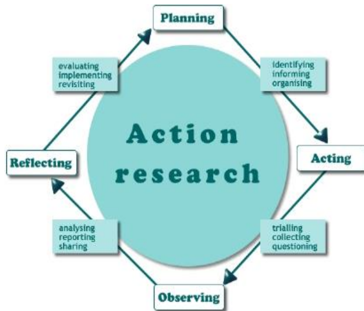
Figure 2. The scheme of participative action research approach

The object of this research was the involving parties in quality assurance section of UNNES from the level of institution, faculty, and the programs level. Meanwhile, the informant of this research were the head of the study program, the head of the faculty/institution and supporting unit, lecturer, program administrative staffs, and students.