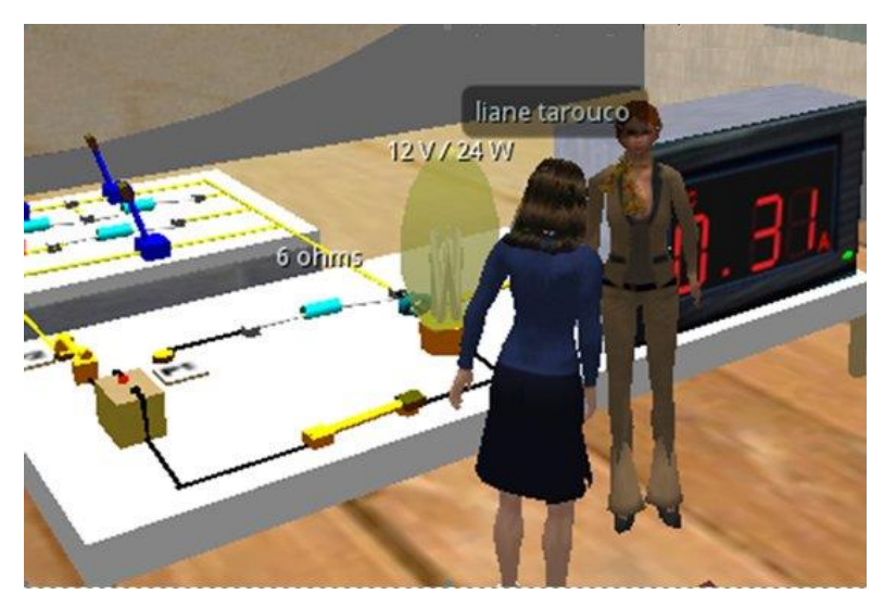
Figure 2. User avatar (left) and a conversational agent (right).

The pedagogical approach used in the implementation of the labs is supported by the Kolb Cycle (1984) which proposes to be the experience the motto for a process of reflection that should lead to the consolidation of abstract learning and conceptualization, which will create conditions for the student to make the transfer (translation of knowledge) to other contexts becoming able to realize new experiences.