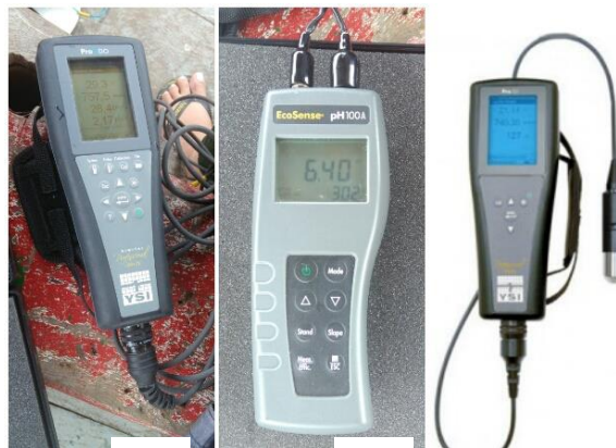
FIGURE 3: - A): OXIN A) R YSI - P B) DO (imag C) n on 05/15/2018 at 10:57 am on the Miriti lake); B): YSI ECOSENSE PH100A (image taken on 05/15/2018 at 10:55 am on the Miriti lake); C): Conductivity meter YSI PRO 30. Authorship: Author 2018 (A and B) and internet image (C).

The Biochemical Oxygen Demand (BOD) determines the presence of a water source for the decapitation or decomposition of organic matter. The procedure of collecting each sample of water is the standard, in the literature as in DERÍSIO (2012), which is the water is collected in glass bottles with a volume of approximately 300 ml. In this analysis, two vials were selected at each collection point, which were filled until transhipped. This procedure was carried out with great care, because air bubbles inside the samples are avoided because the air can be altered in the results of the analysis.