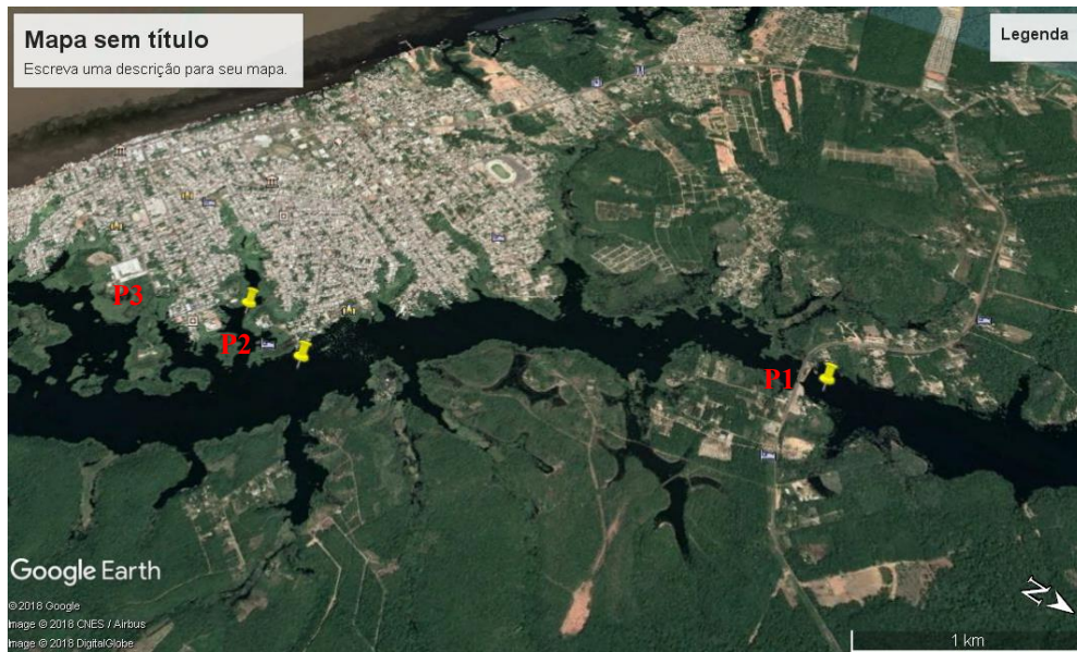
FIGURE 2: Satellite image of the study site with collection points