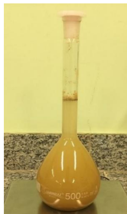
Figure 3. Set weighing.

To determine the specific grain weight, the pycnometer method was used, following the procedures of NBR 6508 (ABNT, 1984) [9]. Initially the samples passed through the 2.0 mm aperture sieve, soon after, they were placed in the oven for drying, then each one was weighed. In order to avoid particle loss, distilled water was added to the pycnometer reference line. But before the material was added, it was weighed. Stirred to the outlet gas present, and again distilled water was added to the reference mark. Then, the set was weighed (Pycnometer + soil + water), shown in figure 3.