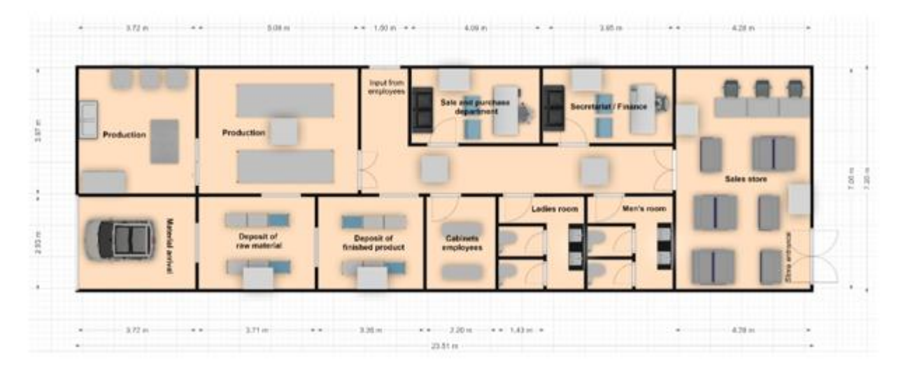
Figure 3- 3D Floor Plan

Figure 2 represents the floor plan of the installations in 2D format.