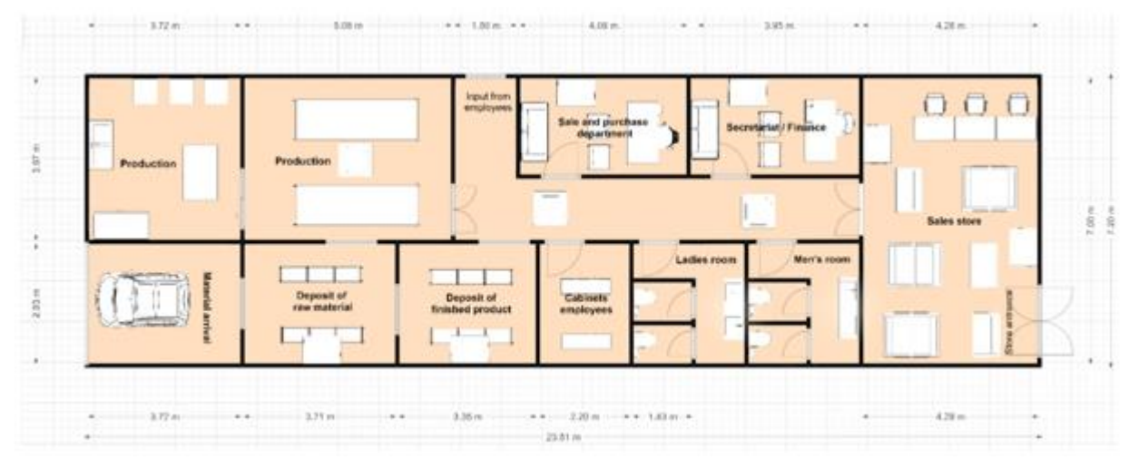
Figure 2- 2D floor plan

Figures 2 and 3 show the floor plan of the microenterprise facilities, indicating the sectors where the production process stages occur.