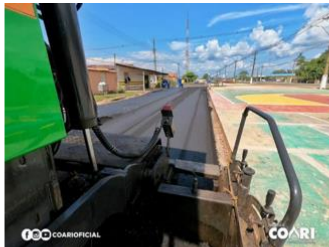
Figure 6: Resurfacing in Coari Street.

According to the [25], the city has a road network of 50 km of paved roads and 60 km of its 15 back roads. Currently, in 2019, Coari Prefecture has been doing asphalt resurfacing work throughout its road network, as shown in Figures 6.