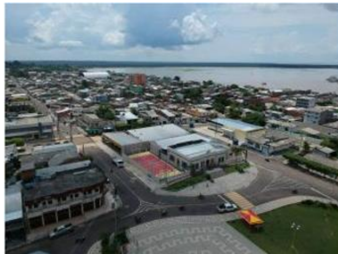
Figure 3: Coari Municipality.