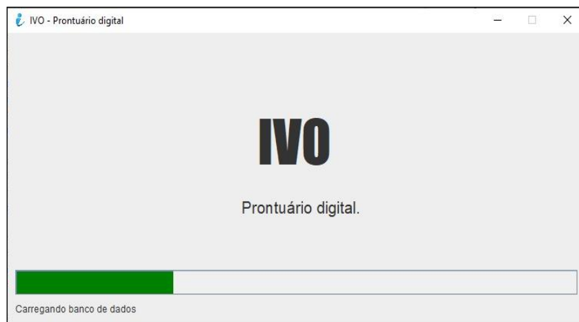
Figure 2. Screen of startup of the system IVO. Campo Grande/MS, 2019.

The first version of the software IVO, a digital tool for cost information and collecting clinical, laboratorial and therapeutical data from Sickle Cell Disease patients, has been finalized and it is available for testing by researchers. Figure 2 presents the system startup screen when database data is loaded.