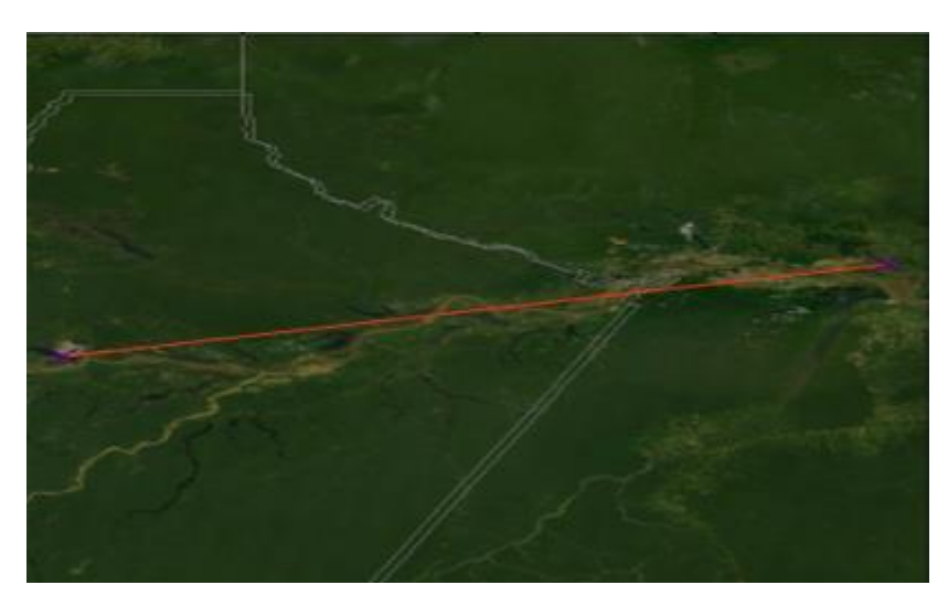
Figure 1 - Map of the vessel's trajectory location for collecting waste data.

The study was conducted in the waterway mode between the Amazon (Amazonas) and Tapajós (Pará) Rivers (Figure 1).