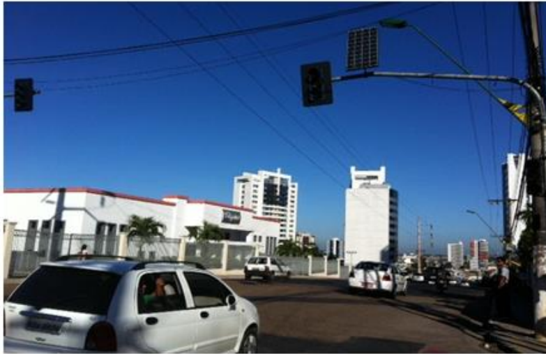
Figure 2 - Traffic light with photovoltaic power system in Manaus

light, a switching system has been created for the power grid. This will only come into operation in case of emergency, such as several cloudy days or any other factor that interrupts the traffic light supply by the energy generated through the photovoltaic plate.