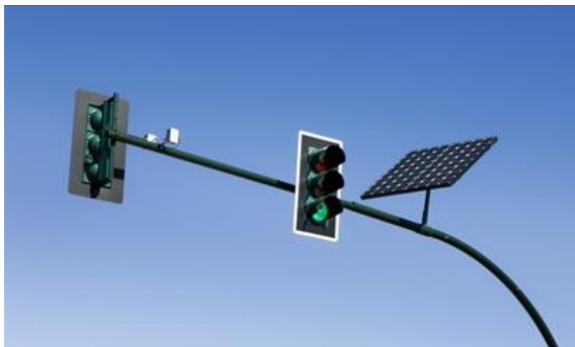
Figure 3 - Traffic light with photovoltaic power system in Manaus

Figure 3 shows the traffic light installed with photovoltaic system, in order to get the most from solar energy, that is, using sunny area available for such purpose. Solar Powered Traffic Light "aims to use solar energy, captured through photovoltaic plates (s), in traffic lights, providing energy savings and low cost.