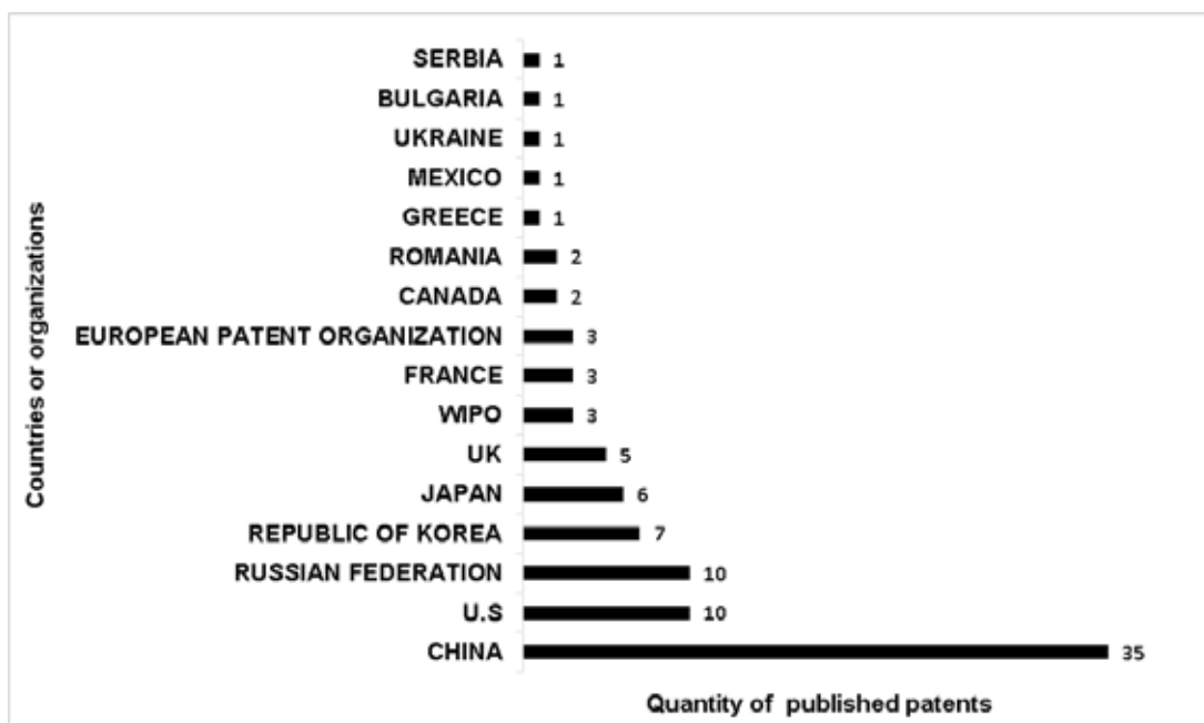
Figure 2 - Number of patents published by countries or organizations. Source: Espacenet (WIPO: World Intellectual Property Organization)