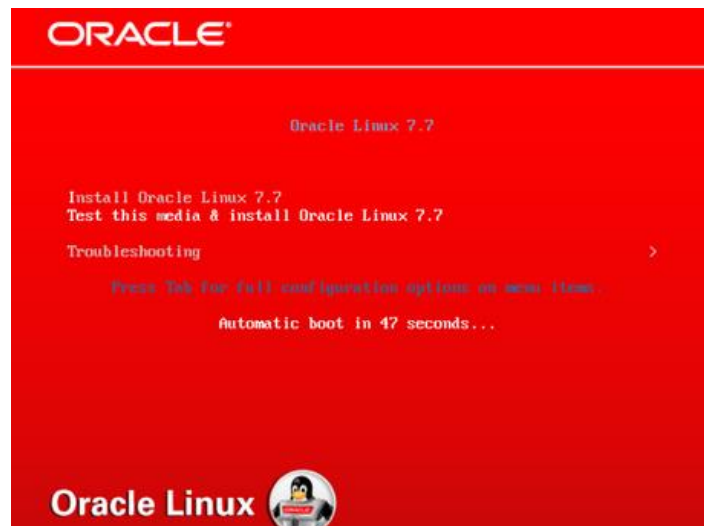
Figure 06 - Initial screen for installing oracle linux 7.7