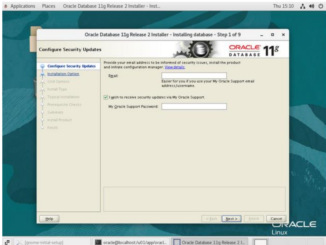
Figura 07- Tela inicial da instalação do oracle database 11g.