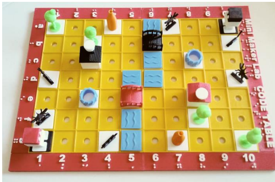
Figure 3. MML Code Table board game adapted for the visually impaired. MML, Salvador, 2018.

The characters missions are to collect the garbage scattered around the city (bottles and tires) and cover the water tank of the player's house, located on the other side of the river. For this, players must use the visual programming language to "program" the characters (robots) to move around the board and carry out their missions.