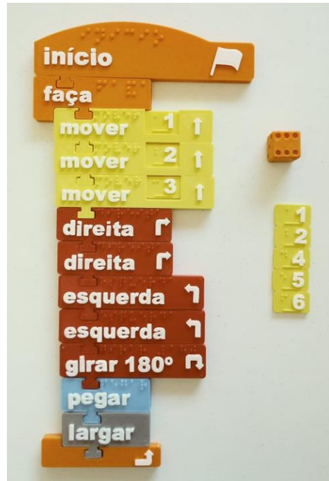
Figure 2. Pieces to make the visual programming language (3D printing in portuguese). MML, Salvador, 2018.

group at the Massachusetts Institute of Technology (MIT) Media Lab. It is a graphic programming language that uses logic blocks, sound and image items, so the user can create their own stories, animations, and games. It was developed for children and young people from 8 to 16 years old, but individuals of all ages use it. It is free for the main operating systems and the user can share their productions online (Scratch Brasil, 2014).