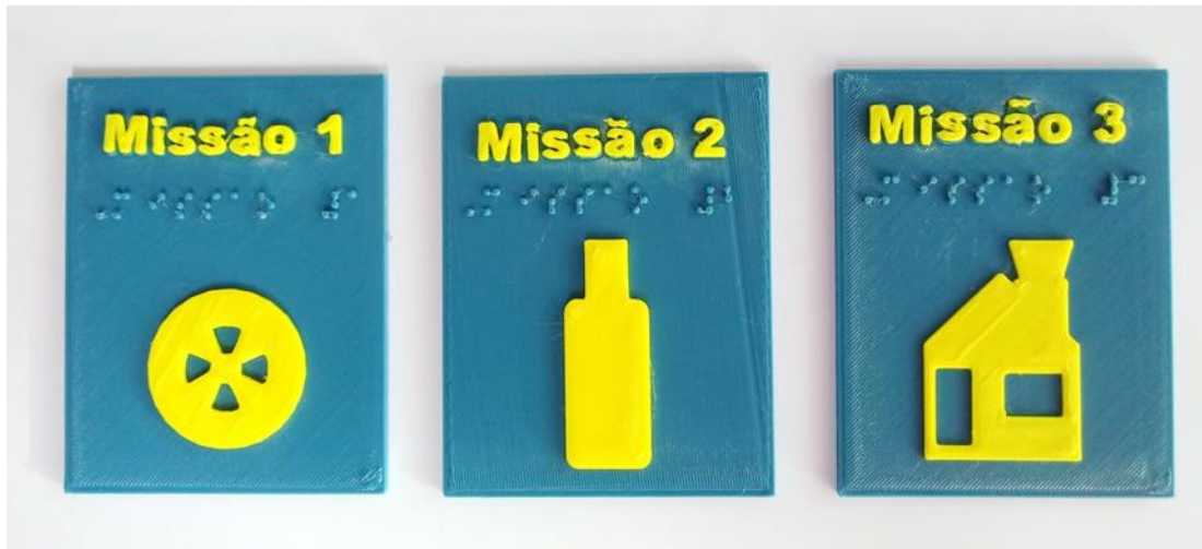
Figure 5. Cards with an explanation of the game's missions (3D printing in portuguese). MML, Salvador, 2019.

Purpose of the game: Players must complete each mission drawn among the cards;