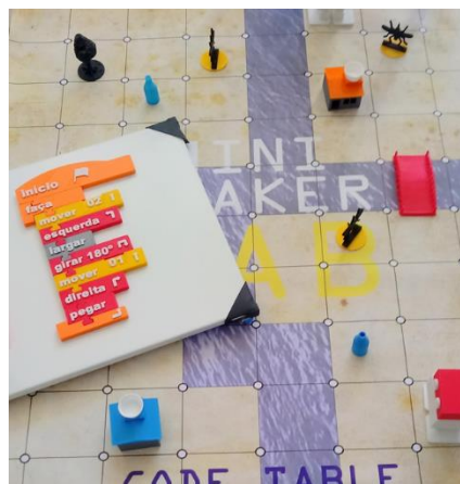
Figure 1. MML Code Table, Salvador, 2018.

MML is a startup that disseminates the maker culture by stimulating learning through playful activities and developing solutions for educational robotics and logical reasoning using 3D printing. Among its products, there is the MML Code Table, composed of a generic board game made of canvas (Figure 1), characters, obstacles and pieces of visual programming language (which fit together). This set of structures allows players to move their characters to complete missions, aiming to develop logical/analytical reasoning through an unplugged programming language.