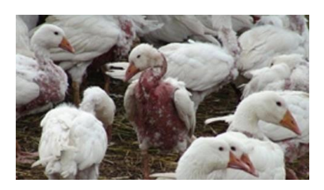
Imagem 2:

With bibliographic survey carried out through scientific articles and journals that comprised the theoretical body.