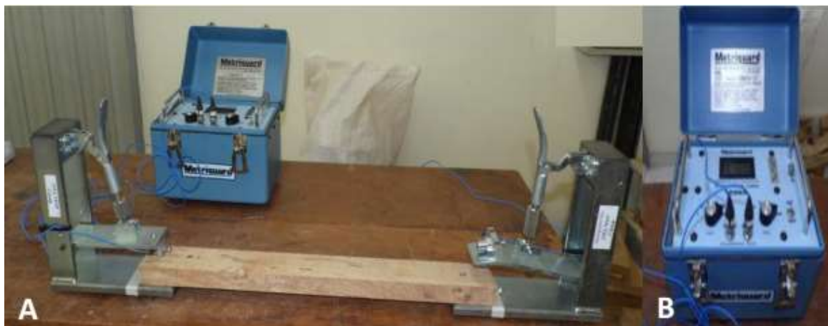
Figure 1. Overview of stress wave determination: A – Sample subjected to impact; B – Detail of the equipment with the result of the time travelled by the waves.

In this methodology, the variables, voltage wave, are obtained from the Stress Wave Timer 239A (Metriguard) equipment, as shown in the Figure 1, and calculated by the equation \text{MOEd} = (L/t)^2 \times D/g \times 10^{-5} , where L = specimen length (m), t = wave propagation time (s), D = specimen density ( \text{kg.m}^{-3} ) and g = gravity acceleration ( \text{m.s}^{-2} ).