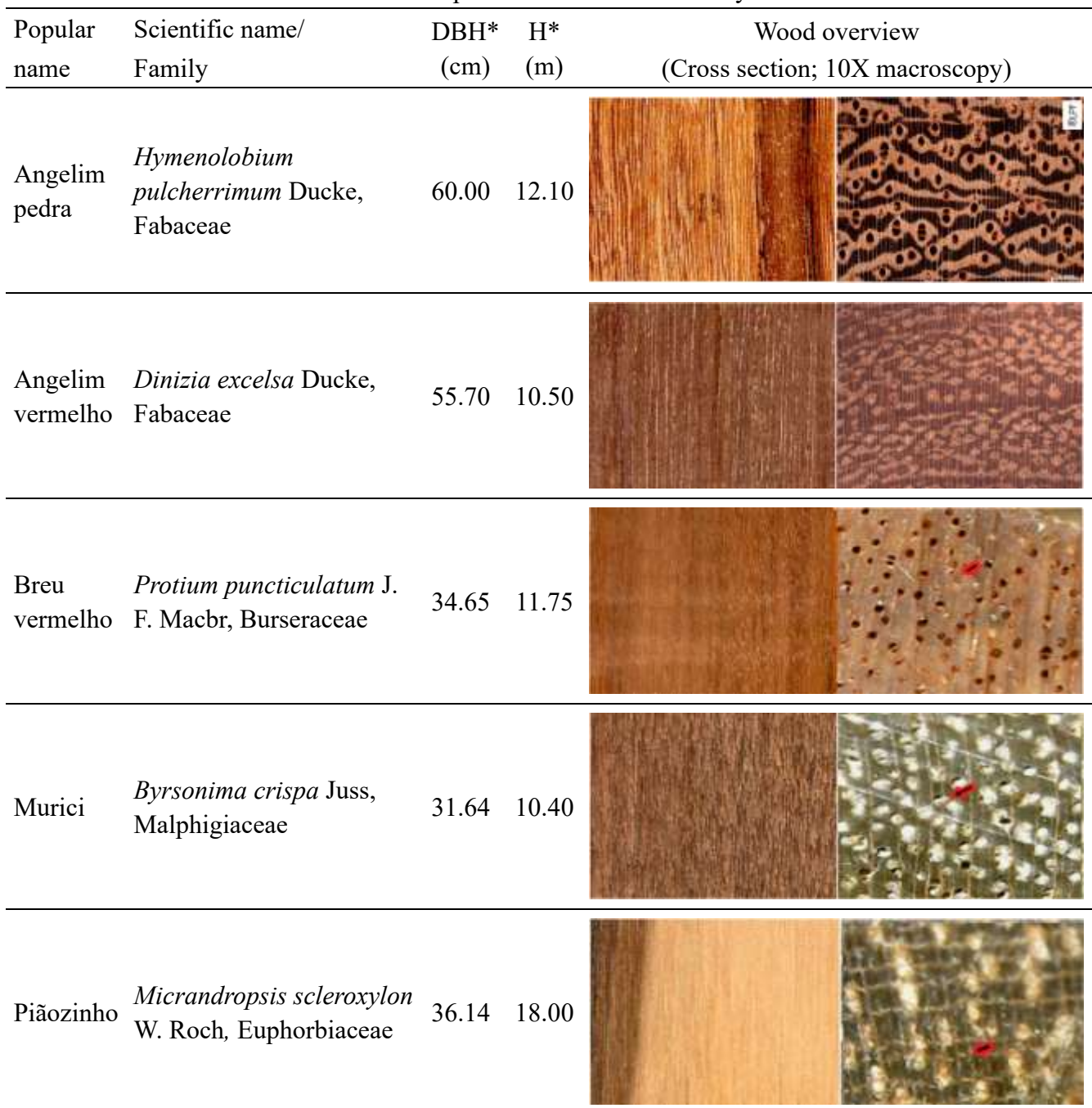
Table 1. Species selected for the study.

individuals per species), based on proximity characteristics between individuals of the same species, such as diameter at breast height (DBH) and commercial height (H).