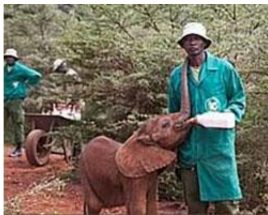
Mbegu, orphan elephant