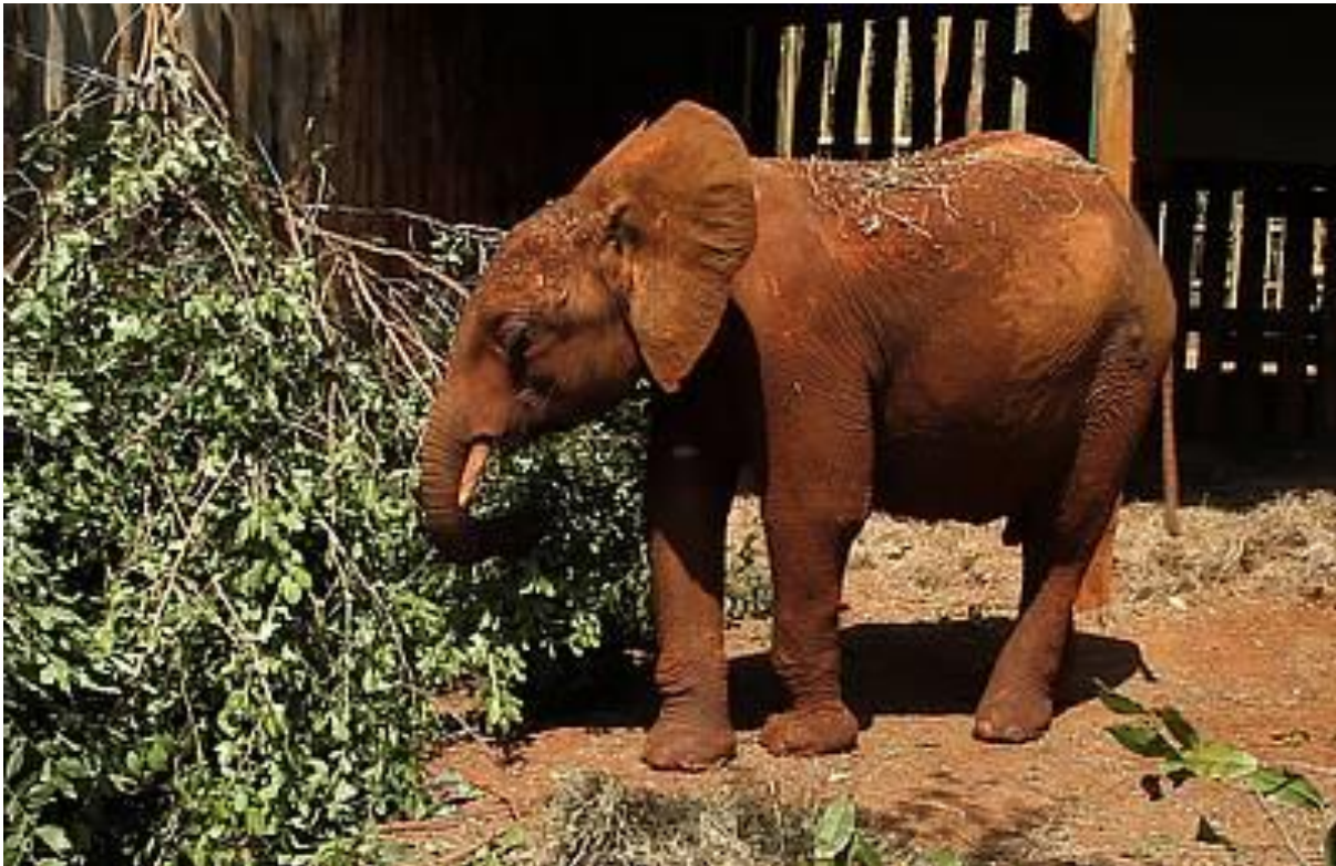
Bongo, orphan elephant