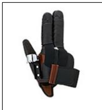
Figure 02: Glove.

Therefore, the equipment has privileges in its elements, favoring the deficient ease of handling, comfort and independence, these components are divided and are around the arm reaching the hand.