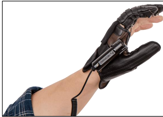
Figure 08: More practical Neomano Glove