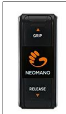
Figure 03: Remote Control.