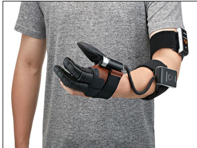
Figure 05: Neomano Glove Design.