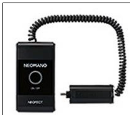
Figure 04: Power Supply.