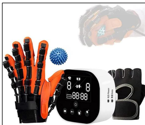
Figure 06: Hand rehabilitation robot glove.

It is not limited to just these tasks; the device contains numerous simple and common features that will help the user to perform their tasks. Therefore, the neomano glove can be compared or improved by the Robot Hand Rehabilitation Glove.