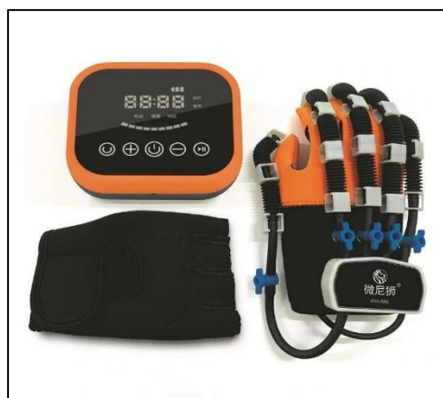
Figure 07: Equipment of the Hand Rehabilitation Glove.

Equipment adaptation process: Therefore, in order to use the equipment, the disabled person goes through a process of monitoring a specialist in several areas, usually a therapist, physiotherapist or technology professional to teach how to use the equipment, however it serves to help the disabled by accompanying with evaluations, training to use the accessory, verifying the comfort and tranquility when using the tool, evaluating the advantages, interests and benefits of the neomano glove being executed, accepting and learning to live with its condition.