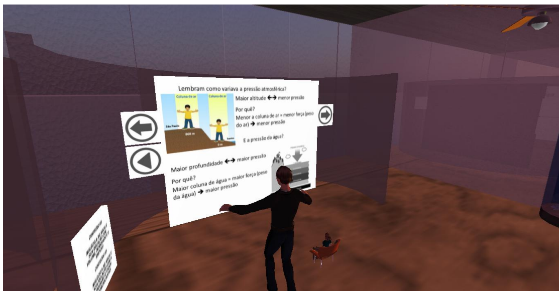
Figure 5: Slides room

In the slide room, theoretical presentations were available as short topics about the units comprised by this experiment, in the same format of exhibition used in presentation editors such as the PowerPoint. Figure 5 presents an illustration gathered during the experiment, where an Avatar is reading about atmospheric pressure and water pressure, directly in the Virtual World.