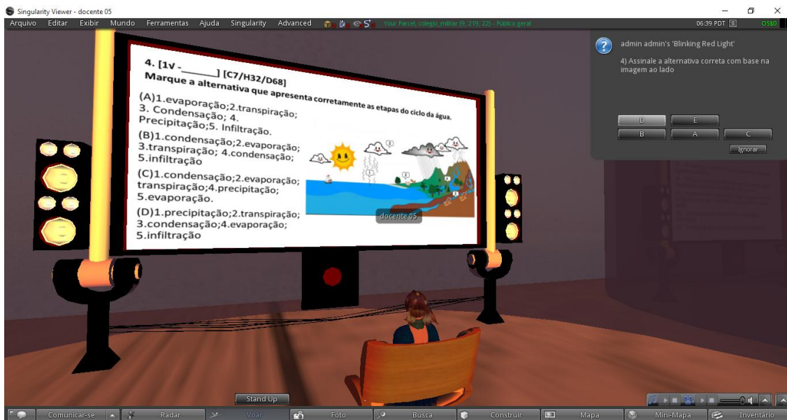
Figure 6: Questions room

In the questions room, several multiple choice questions are made available for users to answer. As shown in Figure 6, the user selects the option and then gets the feedback on the response. The objective of this resource is to practice the knowledge acquired for further evaluations.