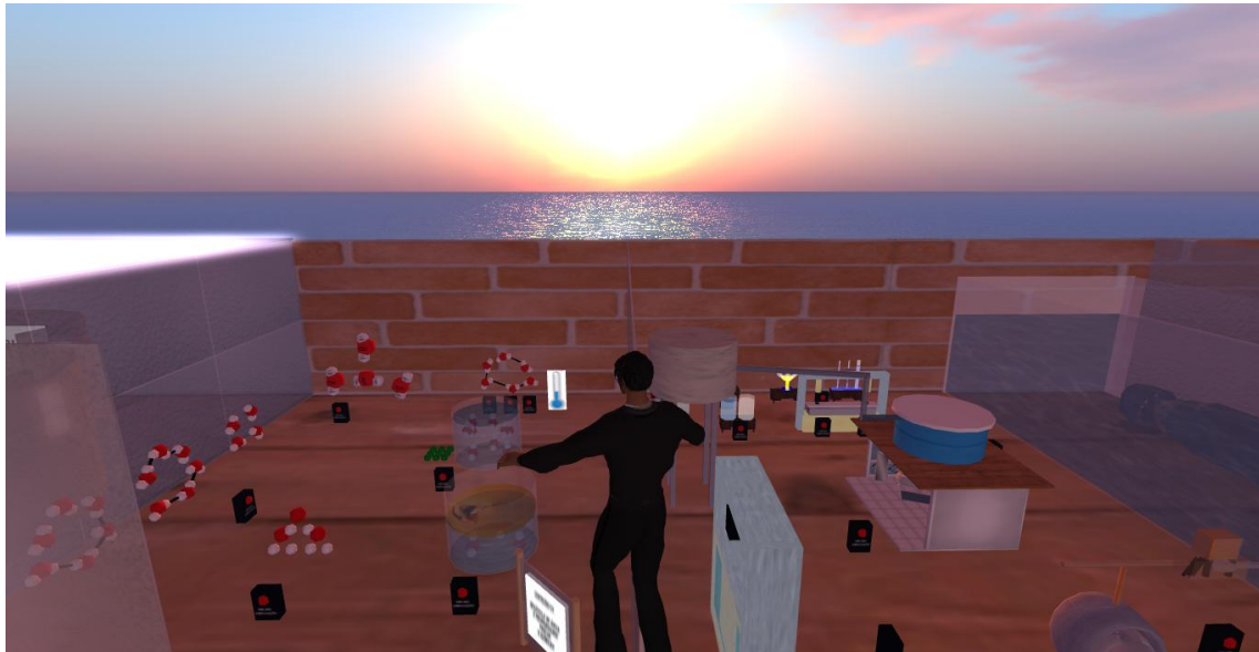
Figure 7: Simulations of the water molecule

Simulations available can be presented in a static way, where users click on a Button to receive information about the experiment they are viewing or can be animated. In this last, when the user clicks on the button to start the experiment, several pre-defined actions took place to show the phenomenon in a practical way. Figure 8 shows other examples of simulation.