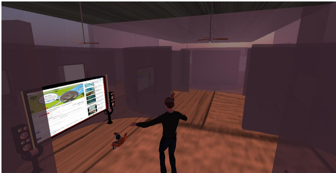
Figure 4: Videos room

The viewer used (Singularity) provided the option of adding texture to an object in multimedia format, through an Internet address. Therefore, videos could be added directly from the YouTube to be watched by users.