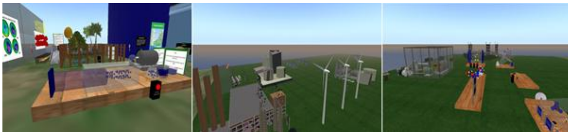
Figure 8: Simulations in the other labs

Simulations available can be presented in a static way, where users click on a Button to receive information about the experiment they are viewing or can be animated. In this last, when the user clicks on the button to start the experiment, several pre-defined actions took place to show the phenomenon in a practical way. Figure 8 shows other examples of simulation.