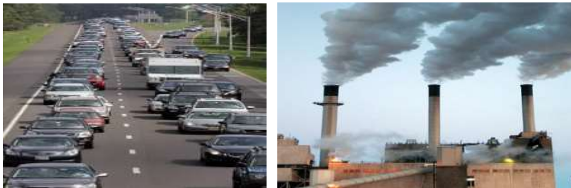
Figure 1: Motor Vehicle Exhaust and Industry Pollution

The universe is currently facing a lot of environmental concerns. The environmental problems like global warming, acid rain, air pollution, urban sprawl, waste disposal, ozone layer depletion, water pollution, climate change and many more affect all living things and nature. Different environmental groups around the world play their role in educating people about how their small actions when combined together can play a big role in protecting the earth. Air, water and soil contamination take enormous number of years to recover. Industry and engine vehicle fumes are other toxins that affect the environment. Substantial metals, nitrates and plastics are poisons in charge of pollution (Walsh et.al 2014). While water contamination is brought about by oil leaks, acid rain, and urban sprawl; air contamination is created by different gasses and poisons discharged by manufacturing plants and burning of fossil fills as illustrated in Figure 1.